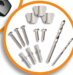
PLASTIC & CONCRETE TANK MOUNTING KITS Accessories supplied for mounting to both plastic and concrete tanks including screws, plugs, wing nuts and drill bits

50% STRONGER 16mm stainless steel tube offers 50% more strength than 12mm tubes