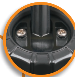
SECURITY LOCK SCREWS Screws lock the tubes into a vertical position preventing jamming in any weather conditions