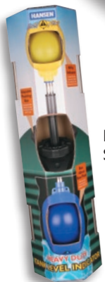
Packaged Store Box

NZ patent 596360 & registered design 415007 Australian patent 2012203010 & registered design 340061. Copyright 2011 Hansen Products NZ Ltd.