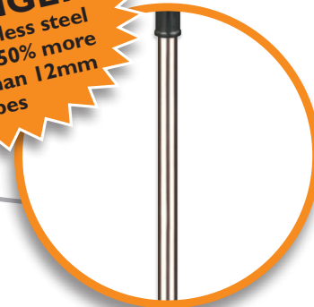
HEAVY DUTY STAINLESS STEEL TUBE 16mm Stainless Steel Tube for long life durability. Versatility of 3 Tubes allows for a tank fluid level reading of up to 2 metres (additional Tubes available for taller tanks).

50% STRONGER 16mm stainless steel tube offers 50% more strength than 12mm tubes