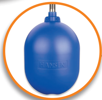
LONG BOTTOM FLOAT 155 x 230mm long bottom float ensures excellent buoyancy for accurate indication of fluid level