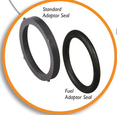
Fuel Adaptor Seal